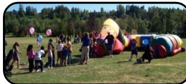
Cameron the Caterpillar